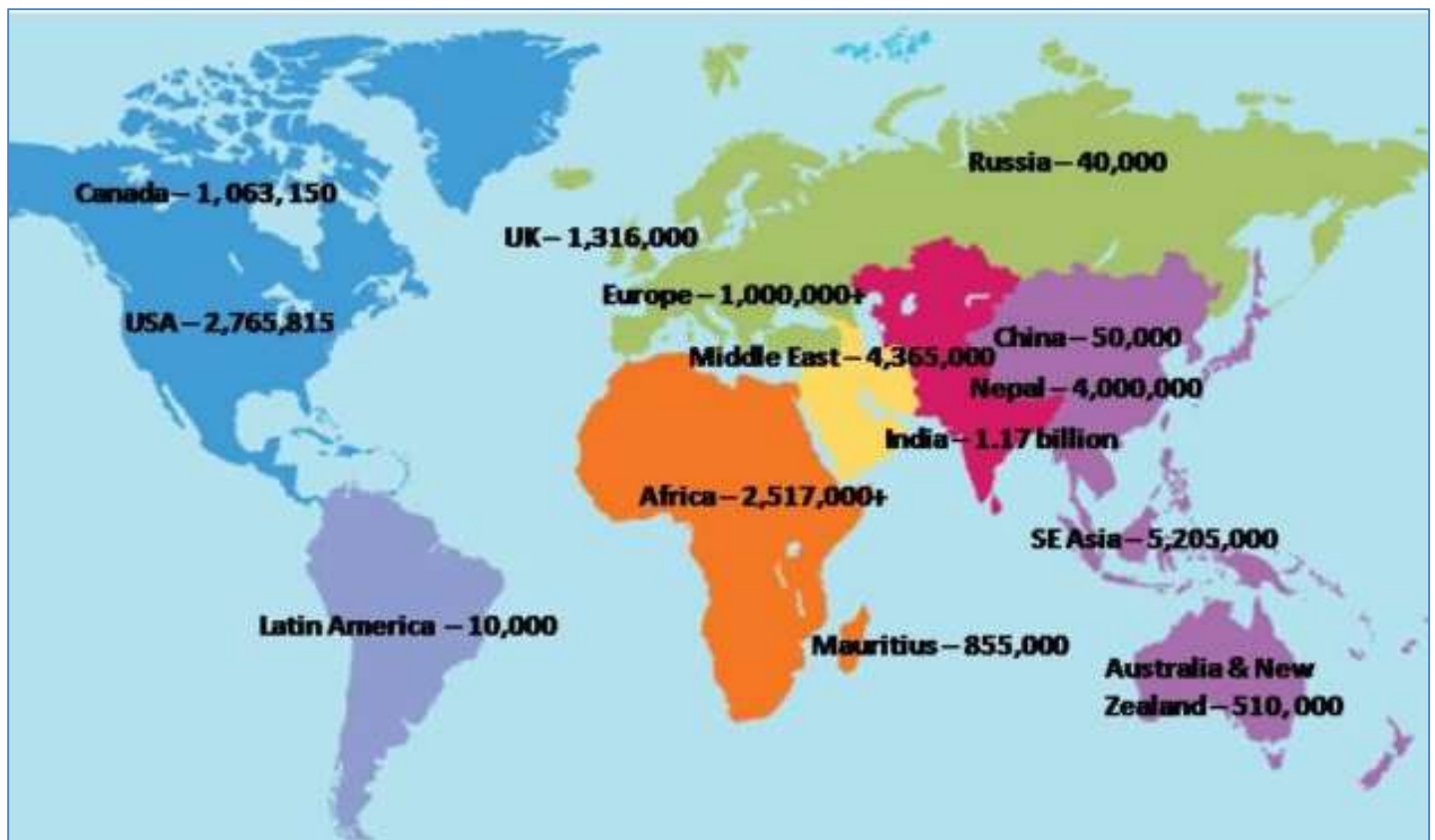
Figure 4. East Indian Diaspora (andrewstojanov.wordpress.com).

Informative revelations that were gained through the substantial documentation of the EIC records at The British Library, the National Maritime Museum Library, Greenwich, and The National Archives at Kew. More research is needed on slaves and indentured laborers from the Indian Ocean area to the Americas such as detailed statistics on the volume of Indians who were brought to the Americas and the areas from which they were transported. As DNA analysis becomes more common, perhaps that will inspire more scholarship and awareness of the East India Company, Indian slave trade, and the Indian Ocean - Trans Atlantic connections.