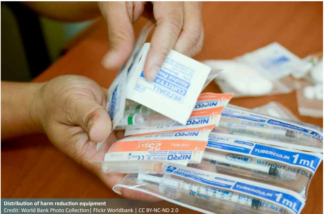
Distribution of harm reduction equipment

The provision of gender-sensitive, trauma-informed, women-only substance abuse treatment programmes in the community and women's access to such treatment shall be improved, for crime prevention as well as for diversion and alternative sentencing purposes.