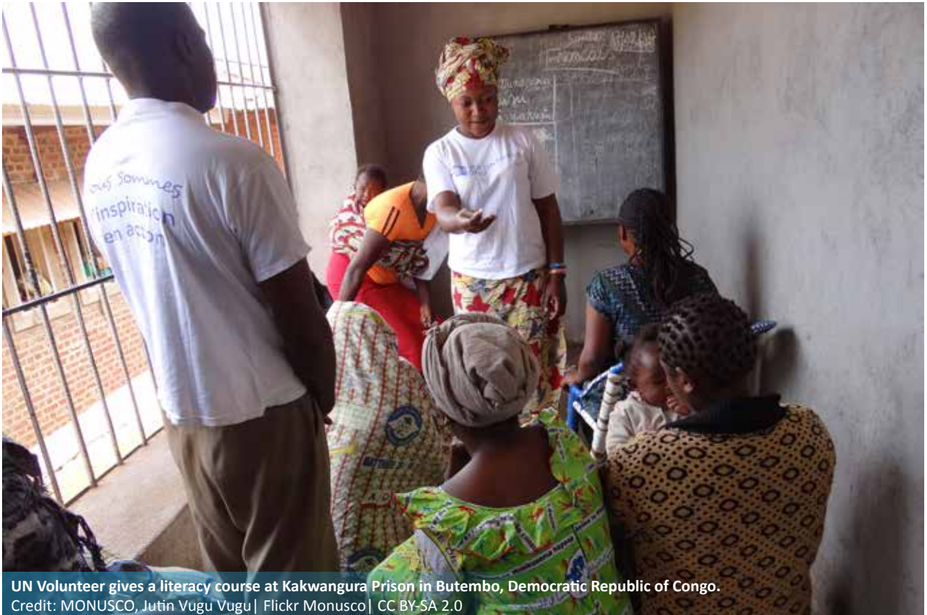
UN Volunteer gives a literacy course at Kakwangura Prison in Butembo, Democratic Republic of Congo.