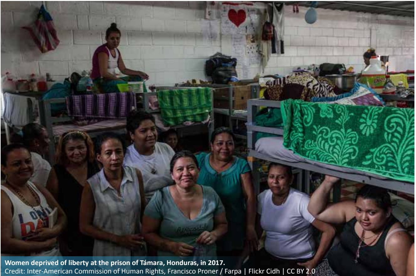
Women deprived of liberty at the prison of Támara, Honduras, in 2017.