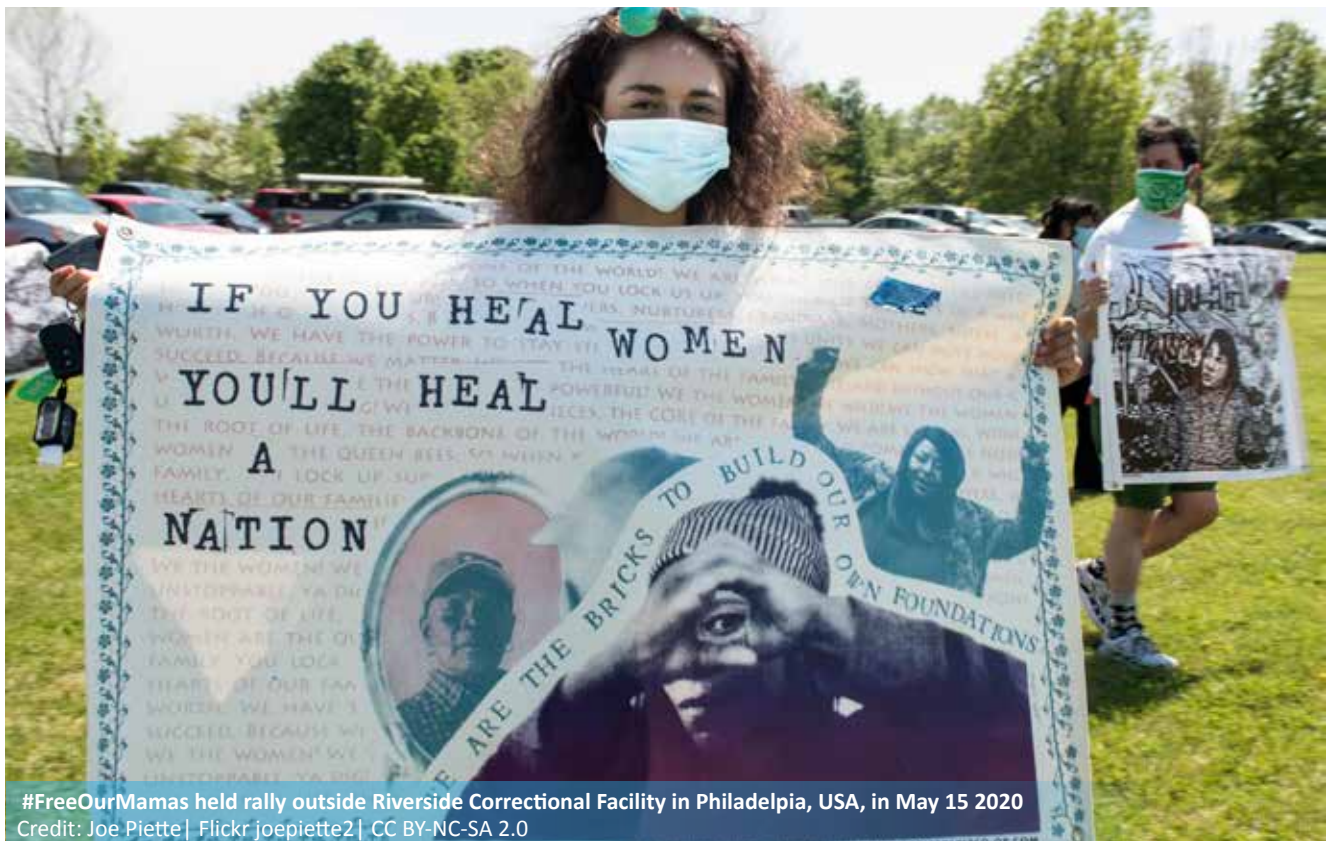
#FreeOurMamas held rally outside Riverside Correctional Facility in Philadelphia, USA, in May 15 2020

Non-custodial sentences for pregnant women and women with dependent children shall be preferred where possible and appropriate, with custodial sentences being considered when the offence is serious or violent or the woman represents a continuing danger, and after taking into account the best interests of the child or children, while ensuring that appropriate provision has been made for the care of such children.