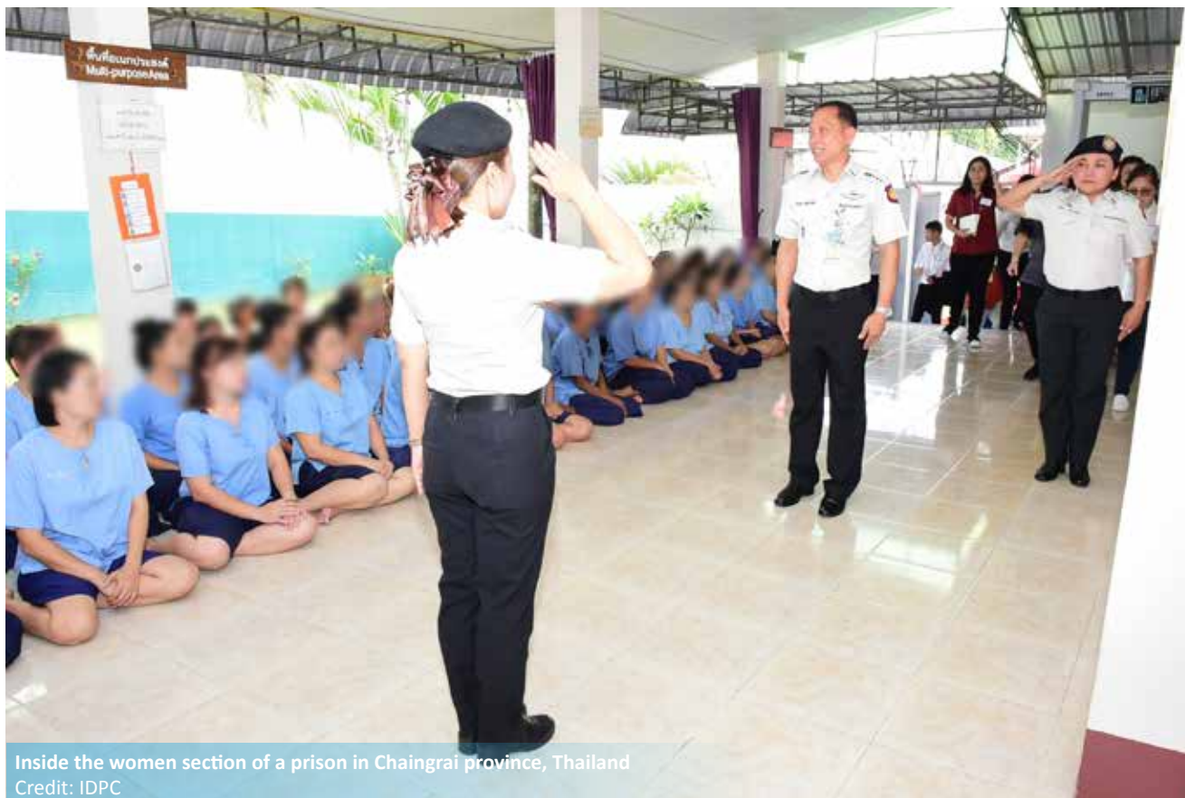
Inside the women section of a prison in Chaingrai province, Thailand