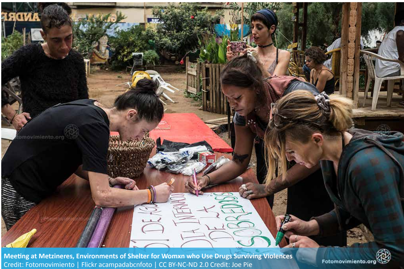
Meeting at Metzineres, Environments of Shelter for Womxn who Use Drugs Surviving Violences

Pre- and post-release services shall be reviewed to ensure that they are appropriate and accessible to indigenous women prisoners and to women prisoners from ethnic and racial groups, in consultation with the relevant groups.