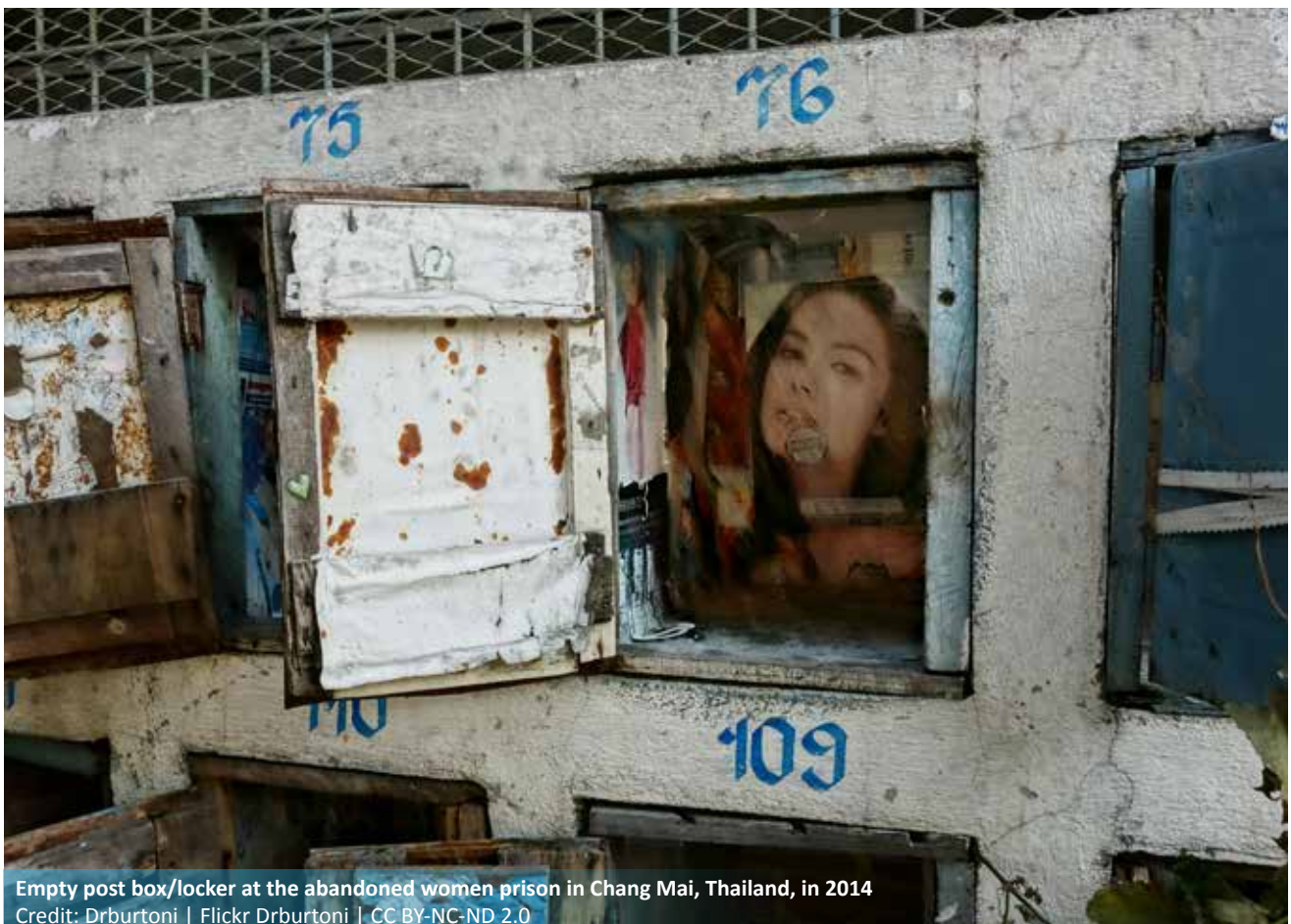
Empty post box/locker at the abandoned women prison in Chang Mai, Thailand, in 2014

In 2020, over 7,400 women were held in Colombian prison 27 – a figure that represents a 136.5% increase since 2000. Approximately 46% of them are incarcerated for a drug offence. Since the outset of COVID19, their situation has become more dramatic than ever, as the government’s response to the pandemic has been to isolate prisons from the community. External visits have been banned, while public phones to speak with family and friends are severely lacking. In some cases, trials have been adjourned indefinitely, leaving women in pretrial detention in a judicial limbo.